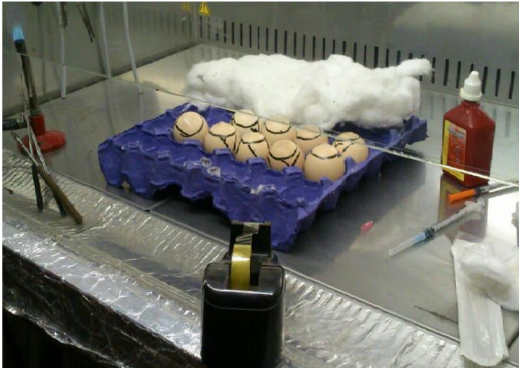
Figure.1. Shows the inoculation method of egg embryos

All chicken embryos injected with WSC Ag and control group challenged with 3ID50 after 4 weeks post immunization exhibited moderate elevation in the body temperature, which persisted for 2-3 days with mild signs of illness and depression without diarrhea and returned to normal condition within 4 days.