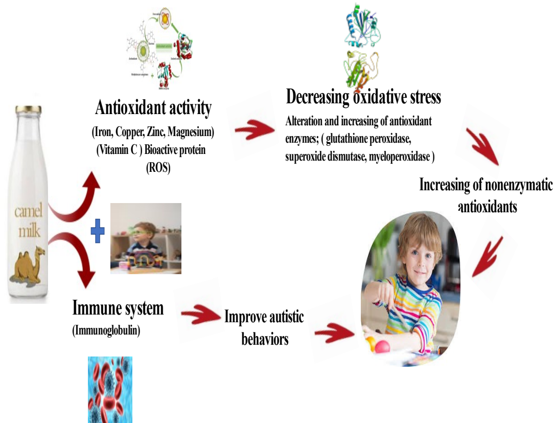
Figure 1. Mechanisms of Camel Milk to Treat Autism

In conclusion, this review literature shows that camel milk contains specific nanoparticles, bioactive peptides, lactoferrin, zinc, and mono and polyunsaturated fatty acids and antioxidants, with antioxidant, antimicrobial, Angiotensin-Converting Enzyme (ACE) inhibition effects which are all representing the major special mechanisms to cure autism in children.