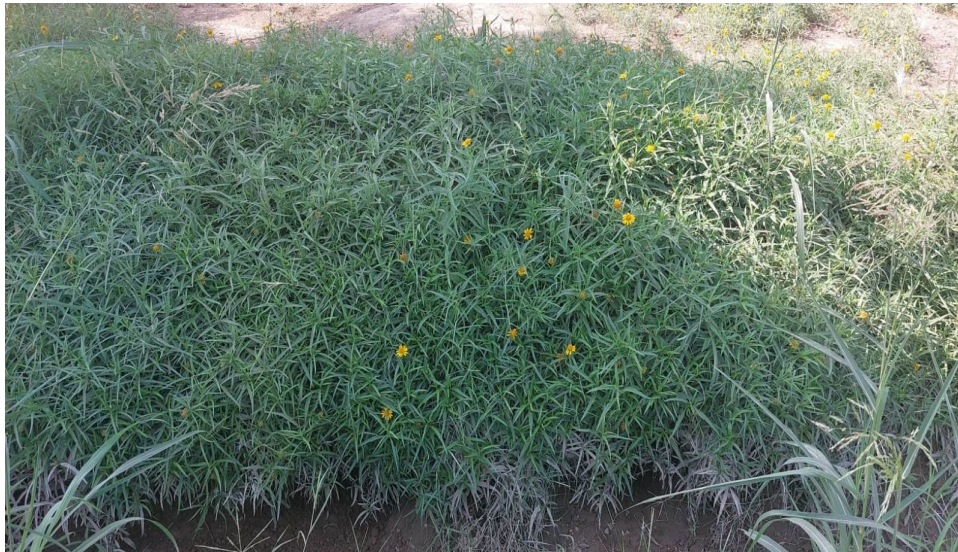
Figure.2: Shows one cluster of Pascalia glauca plant appeared like dense mat

In conclusion , this study approved presence toxic Pascalia glauca plant in one area in AL hamza district / Al-Diwanyia province –Iraq. The plant was related with mortality in cows grazed in this area. The authors recommend that authorities plan and designing a rapid effective strategy to eradicate this plant before it spreads in a free manner with monitoring the invasive area to ensure that the seeds do not spreads. A manual extraction and appropriate herbicidal are preferred to insure terminating all these toxic plant.