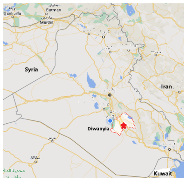
Figure. 1: Shows the infested area (red star) by Pascaliala glauca

The case history revealed high mortality rate with short course of shivering and paralysis of hind quarters then recumbency and death. Medina et al. , (2022) described many outbreaks of intoxication with P. glauca from diverse sources which affecting cattle and small ruminant, while Liboreiro et al. , (2021) revealed other signs in sheep included abdominal breathing , coughing and nasal discharge with morbidity rate reached 20%. The main cause of death hepatotoxicity manifested by multifocal liver necrosis (Giannitti et al. , 2013).