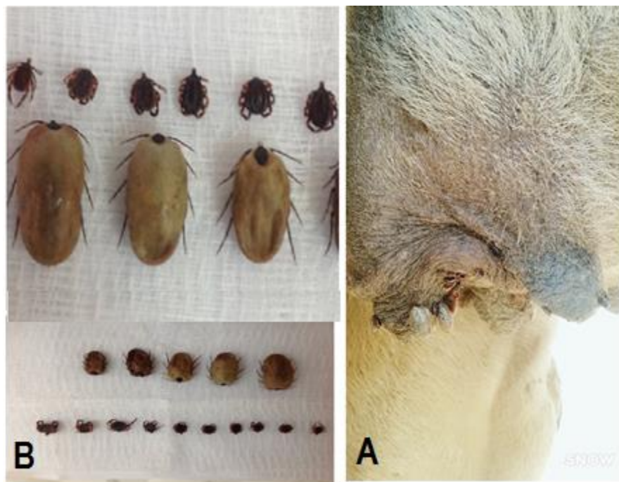
Figure.6: A. Udder keratosis and ticks infestation. B. Different size of ticks that collected from camel.