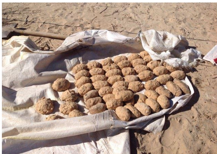
Figure.3: Shows the concentrated food that given to the she-camels