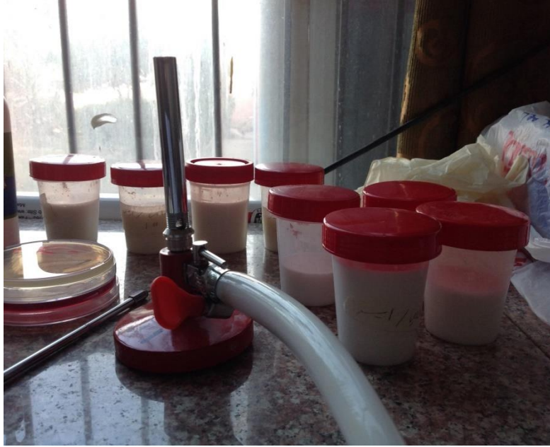
Figure.4: Shows laboratory tests for milk samples