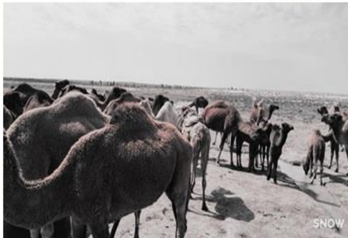
Figure. 2: Shows one herd of camels that included in this study