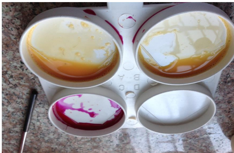
Figure. 5: Shows the paddle of California Mastitis Test and the test