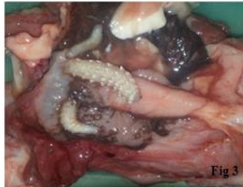
Fig (2,3). The nasopharyngeal region of infested camel by C. titillator larvae showing Congested ( dark color ) , Hemorrhagic , Swollen and Edematous mucosa